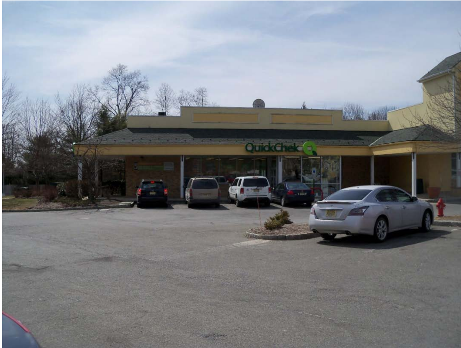
Parking In Front Of Store